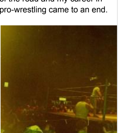
Taylor vs Moondog Sailor White 1983