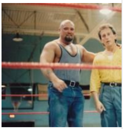
1986 picture with my brother taken after wrestling event at Riverside School Gymnasium, Springfield, Vermont.