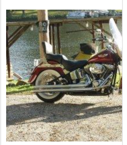
One of my favorite of all the rides I have owned.