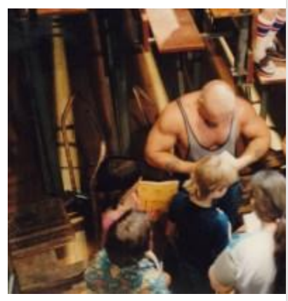
Old 1986 pic of me wrestling at a event in Springfield, Vermont. My match was the main event that night. My life changed after that. I was hit head on by a drunk driver who was driving on the wrong side of the road and my career in pro-wrestling came to an end.